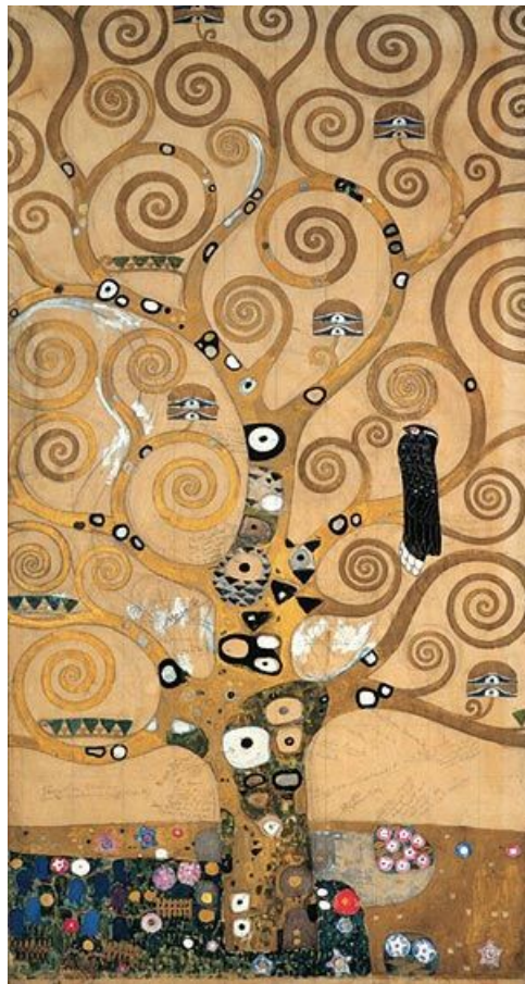
Figure 1: Example of an art nouveau image from Gustov Klimt ‘Tree of Life’

Taking our inspiration from this art movement, we will focus on curved lines in particular ‘parametric curves’ that can be used to control plotting out circular and curved forms with a focus on spirals. In addition, this lab is inspired by the use of repetitive organic shapes (for example the rich tiled elements in many of Gustov Klimt’s pieces).