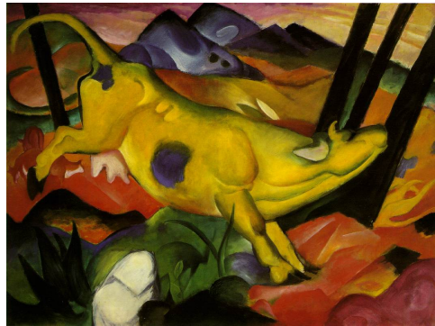
Figure 1: Example of an expressionist animal painting “Happy Yellow Cow” by Franz Marc.

We will be creating a representation of a creature (real animal or fictitious but something that has bi-lateral symmetry and a face) in an expressionist style. For example, consider ‘Happy Yellow Cow’ by Franz Marc or please see the class pinterest board for examples of expressionist animals.